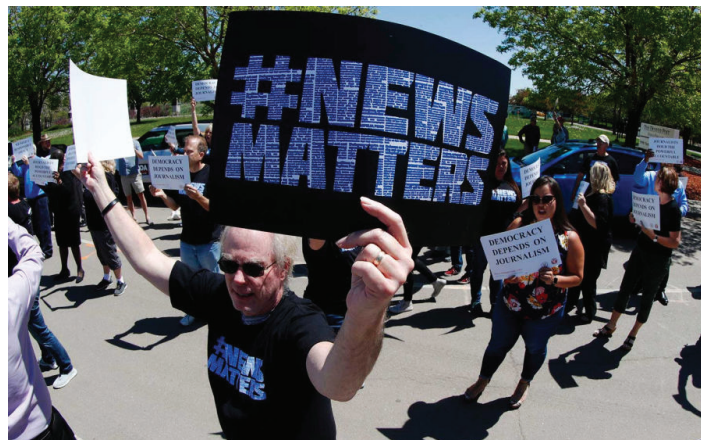
Denver Post employees display placards during a rally against the paper's hedge-fund-backed ownership group, Alden Global Capital, on May 8, 2018.